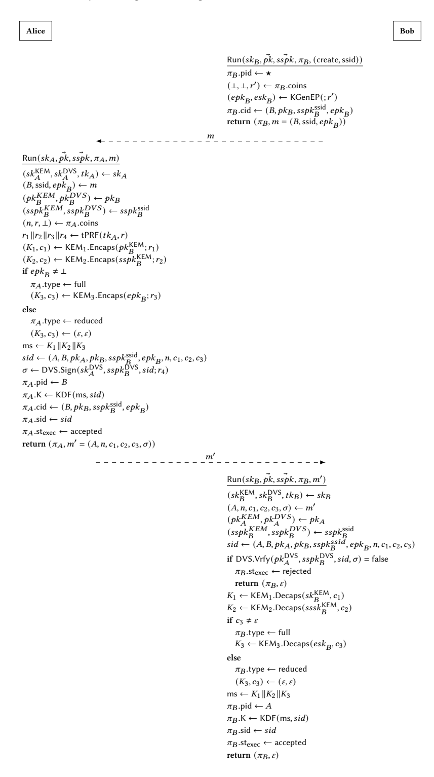
Figure 11: Formal specification of the Run algorithm of asynchronous DAKE SPQR wrt. the model given in Section 7. Note that the generation of long-term and semi-static keys during registration happens at the outset of the game \mathcal{G}_{KE}^{\text{ke-kind}}(\mathcal{A}) and the Signal Server is abstracted away. Thus these elements are not included explicitly in the above description.